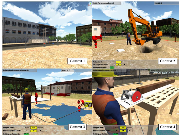
Figure 3. The Game Scenes for the Control Group.