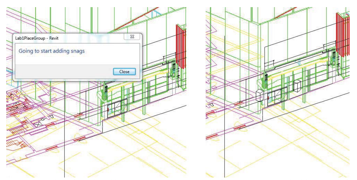
Figure 4: Snag objects introduced into the BIM system (Revit) from the server-end with our proprietary add-on

As a tag is accurately located within a BIM model it then becomes possible to provide guidance to a user to navigate through a building to the location of a snag. Both 2D and 3D models were tested for such navigation with a user preference for 2D plan views for this navigation process (such as provided by Google maps).