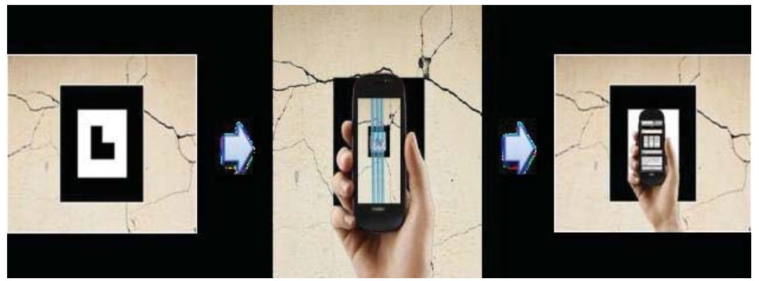
Figure 2: Tag detection leading to BIM model overlay and Snag information

Alignment of the 3D model to tags within the smartphone view was well supported by the open AR toolkits, though the refresh speed of the model display was not sufficient to keep up with normal movement of the smartphone by a user on location.