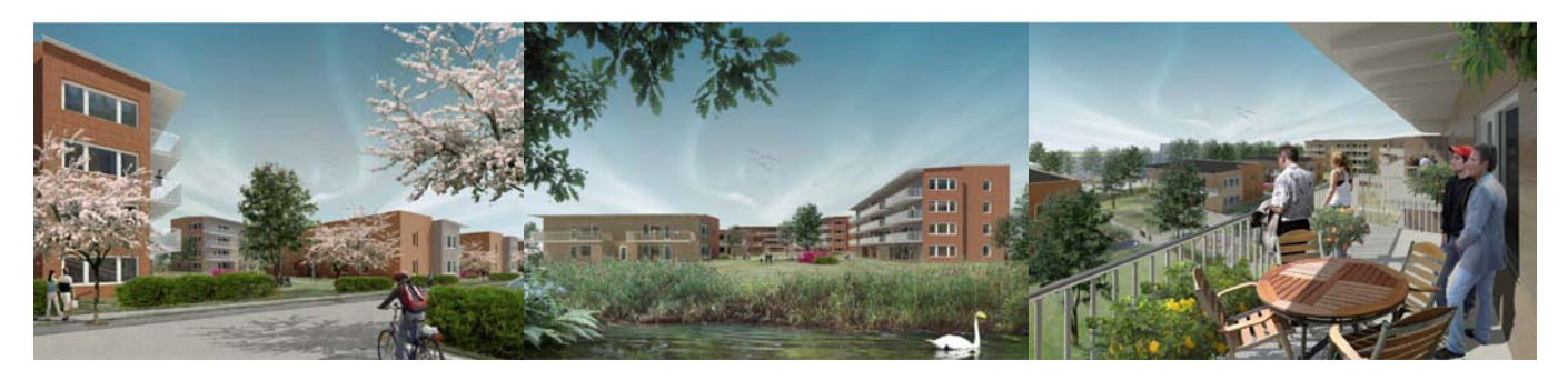
Figure 1: Gyllins Trädgård - Marketing Images (White Architects)

At Gyllins Trädgård MKB Fastighets AB plans to build 87 residential units for rent within 9 buildings of 2 to 4 storeys. The project will include 2, 3 and 4 room apartments between 62 and 95 m2. MKB, have provided the project consultants with a CAD-coordination manual which stipulates the client's expectations with regards to the use of 3D design tools and for some of the design team members it is the first occasion of working with 3D coordinated models.