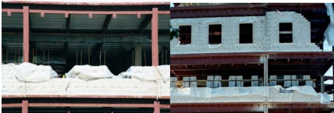
Figure 1: Structural images. Embedding items are similar. Date and location are different

In other words, single feature (or a fixed combination of) retrieval in narrow domain databases such as construction multimedia databases is often not as effective as desired by the user. Multiple-feature (e.g. material+time+location) retrieval approaches are needed (Brilakis and Soibelman, 2005c). Also, even more distinctive features must be explored that will help take advantage of the unique visual characteristics of construction site embedding items and help in meaningfully differentiating construction images of high similarity (e.g. Fig 1).