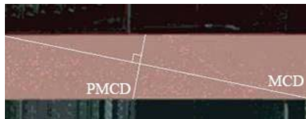
Figure 4: Steel cluster and measurements

Following that, the linearity and (if linear) orientation of the “object’s spine” of each cluster is evaluated. Both are determined by computing the maximum cluster dimension (MCD) and the maximum dimension along the perpendicular axis of MCD (PMCD) (Fig. 4). In the case of elongated polygonal objects, MCD is usually the line connecting the edges that are the furthest apart and can be considered as the object’s “spine”. Also, since PMCD can occur at any position along the perpendicular axis, every possible choice is evaluated. This step is essential since it also reduces the model’s vulnerability to noise (cluster topical inaccuracies) and fast, since it has a linear computation time ( O(n) ). These dimensions are then used to determine the linearity and orientation, under three assumptions: