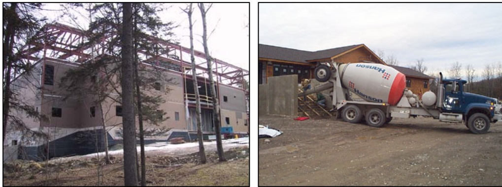
Figure 2: Visual Distractions Used – (a) An Example of a ‘Safe’ Visual Distraction and (b) the ‘Danger’ Distraction.

While using the application to enter data, participants will be required to be conscious of the images being projected and maintain a mental tally of the number of ‘danger’ photographs of which they were aware. Post-experimental analysis of the data will allow us to compare the actual number of ‘danger’ images projected with the number reported by the participants in order to derive a measure of awareness per participant. Unlike the noise levels, which we consider to be interfering distractions because they have the potential to interfere directly with a user’s ability to interact with the mobile device, we refer to these visual distractions as active distractions (the ‘danger’ photographs) because they require a participant to react to the distraction in some way – in this case, by tallying the number of instances of a given image – and passive distractions (the ‘safe’ photographs) because they distract the participants but do not require an active response.