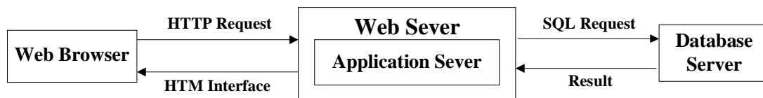
Figure 1 the basic working principle of B/S mode

The working process: The client side accesses the Web server through URL, the Web server requests data from the database server, and returns the results which have been obtained from Web server to the client side browser by the form of HTML.