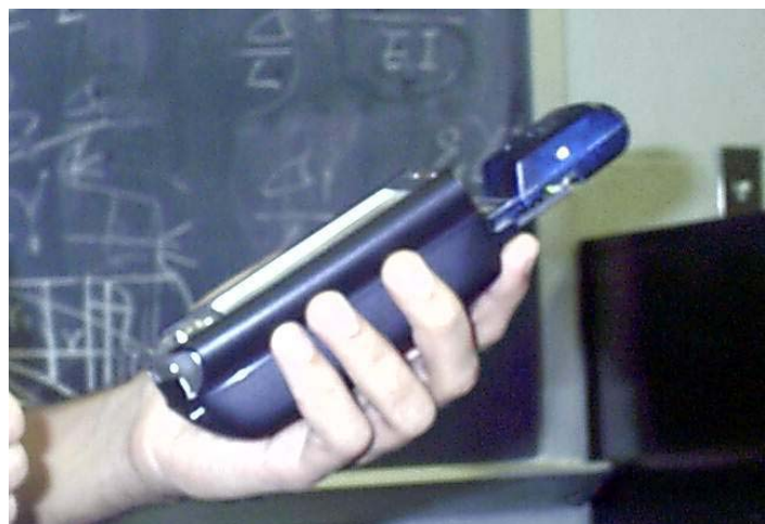
Figure 3 Client: iPAQ 3850 , GPS and Wireless Card

We have implemented the components of the Prophet architecture and built a client application that uses this architecture to proactively deliver project information. The implementation uses an iPAQ 3850 handheld computer with a GPS receiver and a wireless Ethernet card as the client hardware platform. The client software is built using a combination of Embedded Visual Basic and Embedded Visual C++ and uses the Pocket SOAP library to support remote service interaction. The client software uses AutoCAD OnSite View to view CAD drawings, Pocket Word to view Word Documents and custom viewers are