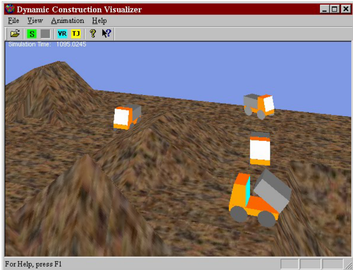
Figure 2. Animation snapshot of a dumping area in an earthmoving operation showing one truck dumping in a fill and another waiting to dump

and the site personnel by providing them with a virtual experience of how and what should be constructed. Modelling and subsequently visualizing a construction scenario is capable of providing in-depth insight necessary to effectively plan and schedule construction operations by revealing the dynamic interaction among various involved resources and concurrent processes without relying on the planner's judgement, imagination, intuition, and experience.