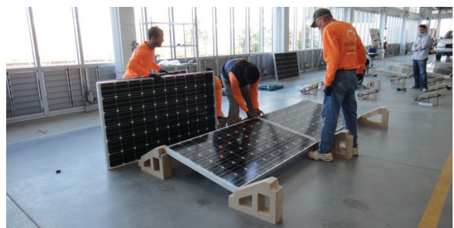
Figure 1: Time and motion study for installation of PV panels.