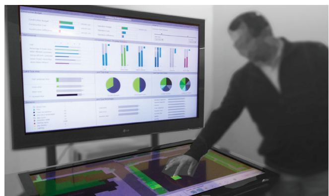
Figure 2: CLIM Tool. Multi-touch table and dashboard screen.

Campus Landscape Information Models allows direct collaboration among different disciplines by accessing real time information and evaluations on the screens, allowing for storage and retrieval of alternative designs as projects or sets of projects –or scenarios. CLIM was built specifically for our university campus, therefore the specific information about our university was used to construct the two fundamental models in which CLIM is founded: Information model and knowledge model (see figure 1). The information model was constructed directly from raw quantitative data, such as land use and tree inventory, while the Knowledge models were constructed from both expert and user knowledge, extracted from manuals, interviews, and surveys.