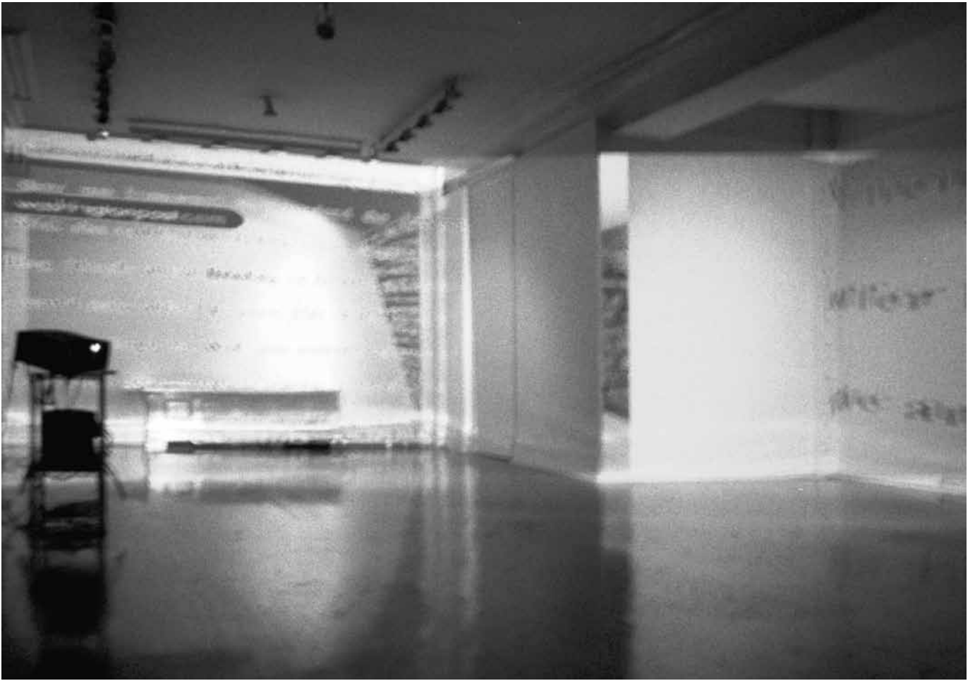
Figure 2. "Flux Space", installation, Arthur Ross Gallery, New York, 2000