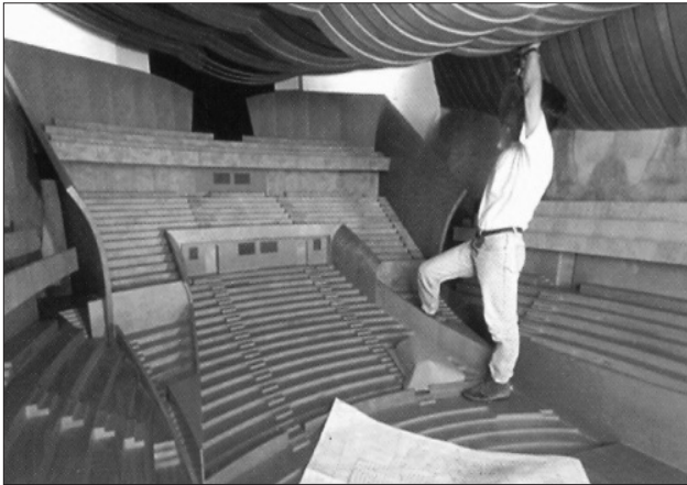
Figure 1A. 1:10 Scale model for Disney Concert Hall