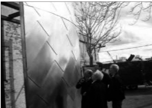
Figure 1B. 1:1 Model for Guggenheim Museum in Bilbao

Therefore, the concepts of prototype and scale model in architecture overlap, especially when we refer to working models. Working models are one of the three types of models defined by Hetchinger and Knoll (2008). The other two are conceptual and presentation models.