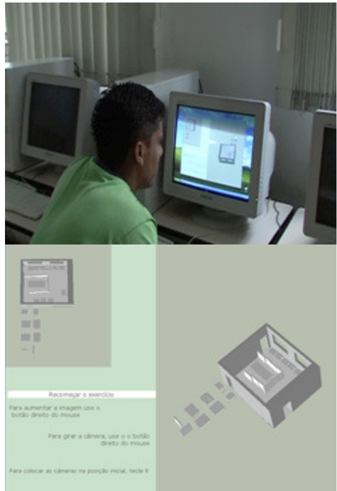
Figure 9. 3D interactive digital interface.

model individually and only then starts the negotiation process. Another difference concerns abstraction, happening more naturally when dealing with representation in the 3D interactive digital model, in which the scale was not fixed, than with the physical model with fixed scale.