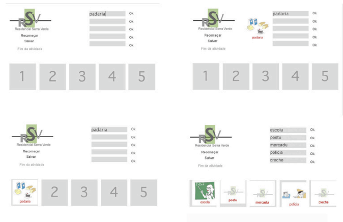
Figure 4. Sequence of use of the interface of preferences.

The second digital interface regarded user's environmental preferences. It was designed to stimulate people not only to use the actual keyboard and repeat the use of the mouse—by clicking and dragging—but also to start thinking about their preferences concerning the place they would live in. Instead of providing a set of images to be chosen, the interface has fields in which users are required to write that which comes to their minds. For each preference a symbol appears and users drag the symbol and place it in order of their preference in the squares at the bottom of the page. Though very simple, it is quite effective for introducing the use of the keyboard quite naturally, and, mainly, for starting a process of real participation in which people are not required to choose among predefined things but to think independently.