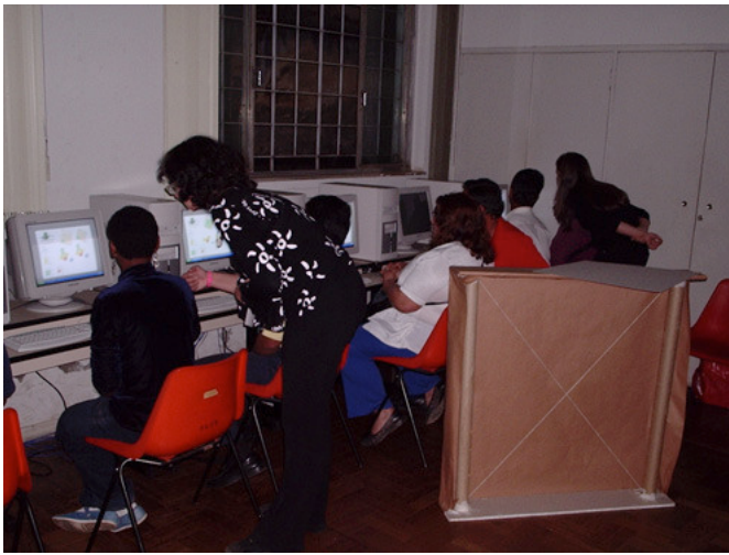
Figure 1. Workshop for digital inclusion.