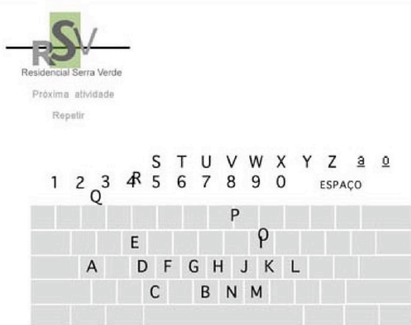
Figure 3. Intermediary frame of the animation of the organisation of the letters in the keyboard.

Before starting the exercise proposed in the second interface, an animation of the letters from the digital keyboard in alphabetical order going to their position in Qwerty's keyboard was played.