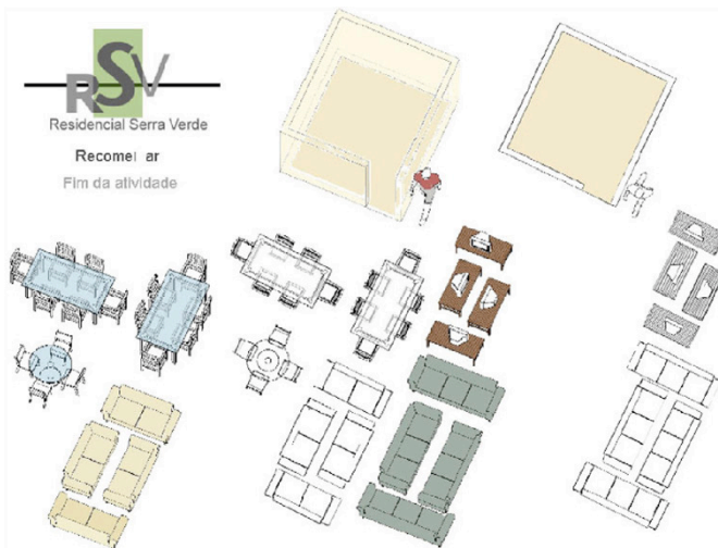
Figure 7. Interface introducing the representation of lived space by means of layout in plan and axonometric.

After the first two workshops we concluded that we have sorted out the problems raised by Ballerini and that certainly the interfaces were effective to get people involved and learn to use mouse and keyboard. However, with regards to the last two interfaces we could not say whether or not people could really understand the space. We could only know that they had a notion of representation, but we were not able to tell for sure if they were merely solving a puzzle or if they were really able to have an idea of the space represented.