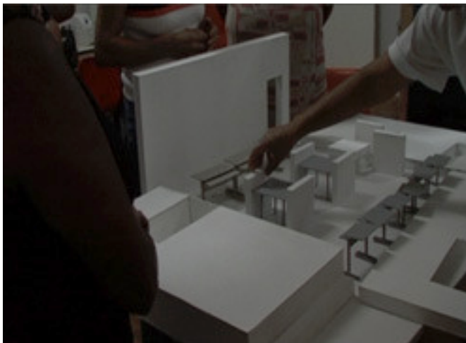
Figure 8. Leader-group relationship in the use of the physical interface.

In the first workshop including this experiment we have proceeded the first part of the digital inclusion as usual, and then asked the group to use the pieces of the physical model to first reproduce the room and layout of the furniture and second to create a space for the coffee break using the cardboard modules. The second version was almost the same, but this time we have given them the room already assembled with some pieces of furniture inside, and asked them to complete it and create the space for the coffee break using the cardboard modules. The same was done with the 3D interactive digital interface in 2 versions (refurbishing and from scratch) in other 4 workshops.