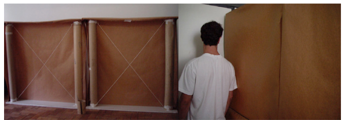
Figure 5. Cardboard modules in 1:1 scale used to assemble an environment in real size.

The average time for going through these first interfaces is little more than an hour. Before using the last two digital interfaces people are required to build a room using a set of cardboard modules of 1 m 2 to discuss notions of area and volume.