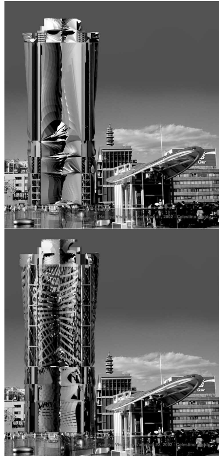
Figure 3. Two variations of the same Generative project: a skyscraper on the Nagoya downtown. The two variations are like twin brothers. Each one is unique but both are belonging to the same species.