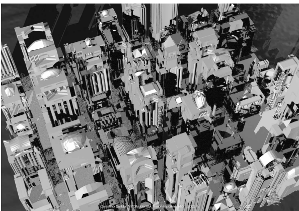
Figure 2. New York DNA. Four city blocks entirely generated by Argenia using an Identity Code designed for fitting the idea of New York.