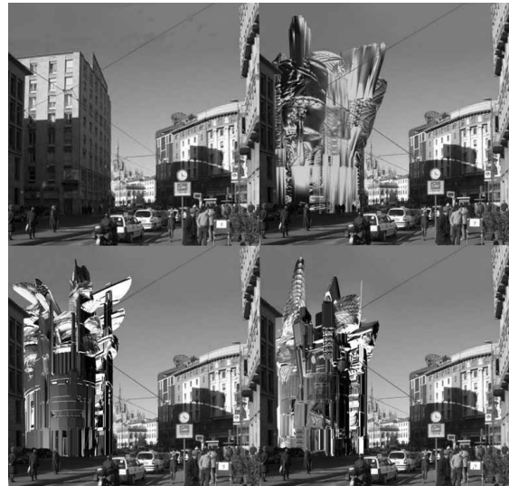
Figure 4. Milan, the Museum of Futurism. Three unique and unrepeatable variations with the same constrains and functional structure, as happens in nature.