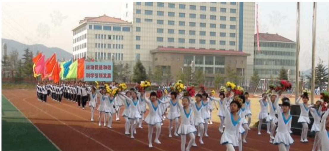
Picture 7.2 New built primary school