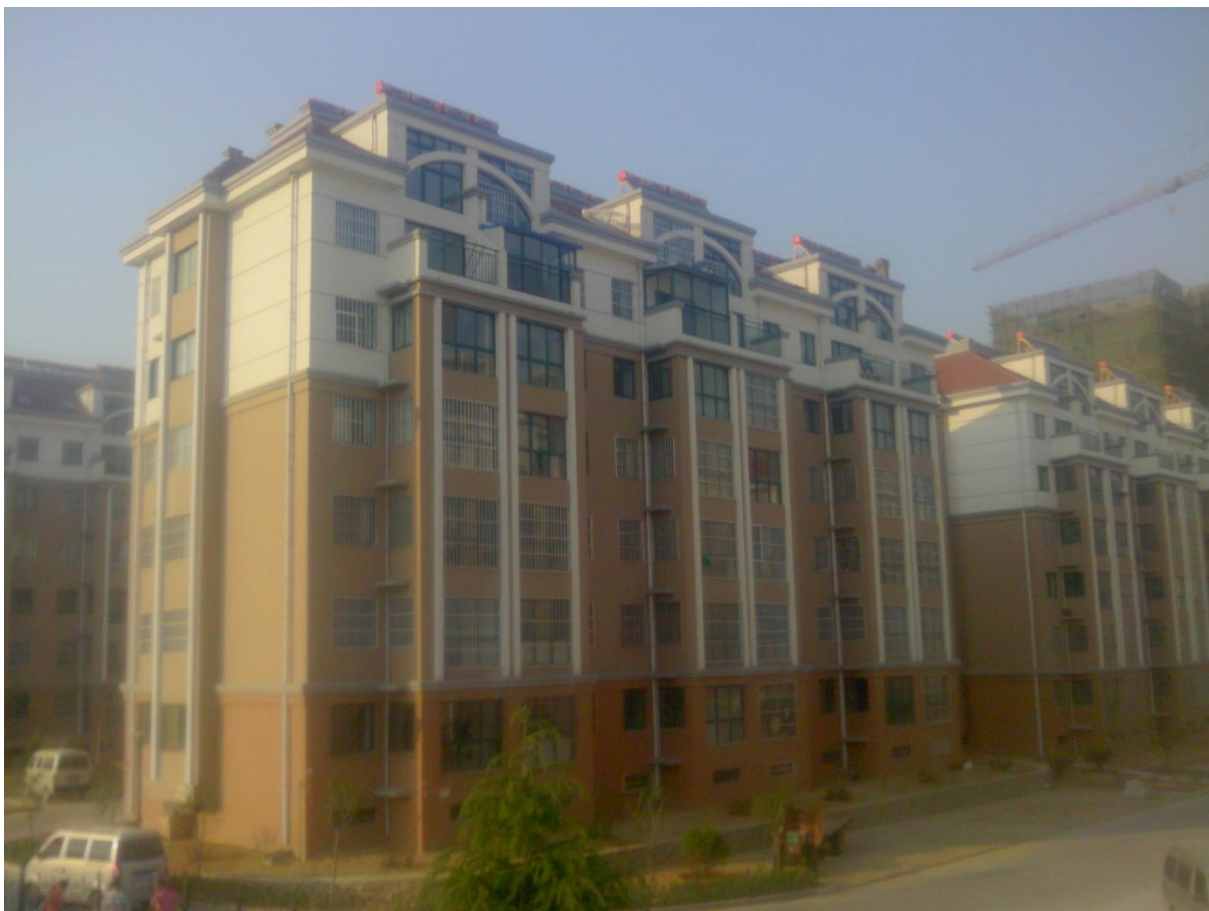
Picture 7.3 New built residential building

New built houses comply with local planning policies, self-developments are no longer existed, green plants areas, indoor toilets and well designed sewage system have helped to solve the local environmental problems. As we can see from Map 8.4, road conditions are much better and more roads around the redevelopment areas, so that transport services are very convenient. After the redevelopment, village residents can received central heating during the winter, however, they also worries about the high heating fee. As new neighbourhood only offer job opportunities for indigenus village graduate, households are not entitled to any work skill training need to find jobs by themselves. Most indigenus villagers have low education and low skill background, hard labour job is their only choice.