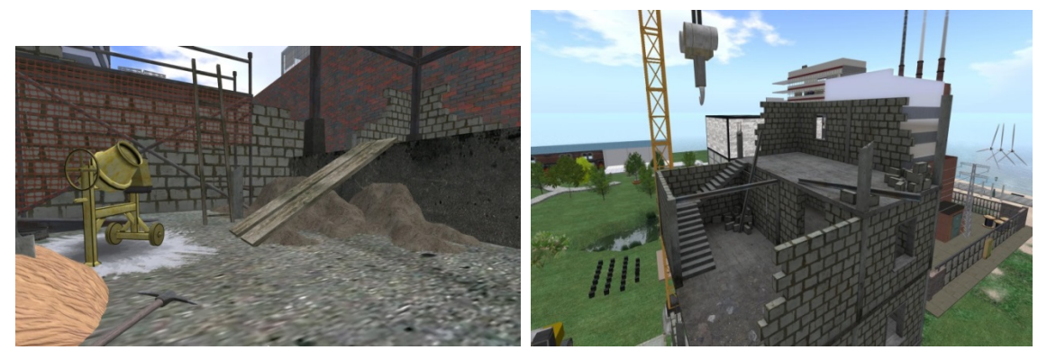
Fig. 2: Site safety explored in a virtual build

Lin et al. (2011) have considered how closely the game or environment has to emulate reality in order to create the desired immersive sensations and reactions, suggesting that high realism may not be cost effective in terms of developing effective educational games for some applications. To emulate reality and in particular the evolving construction site over time, Miller et al. (2012) have proposed to embed the concept of 4D planning (i.e. 3D virtual content changing over time) within the virtual world. Lin et al. (2011) suggested that reality can be emulated in a cost effective way by using traditional images and video footage within the game, but recognised that this may break the sense of presence and interrupt the learning activity. This limitation might be addressed through the use of an integrated Head-up Display (HUD) system within the virtual world platform of Second Life. For example, the developer of the Prohawk HUD has designed it to deliver an uninterrupted learning experience using scripted objects that provide feedback and guidance to learners. This allows participants to make choices, for example about the correct tools for excavation of particular layers of earth, and to learn from their choices (Romulus, 2011). Information about performance of participants throughout the task can also be gathered by the HUD system and reported back to trainers.