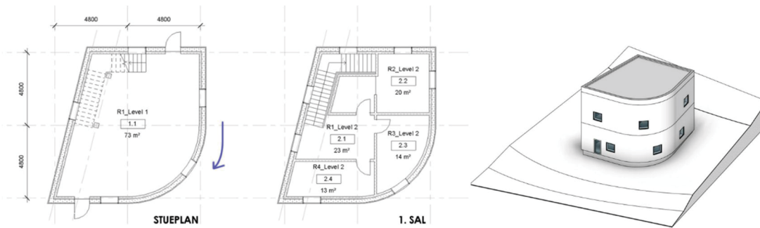
Figure 2: Plan views and isometric view of the test model, Johansen (2015).