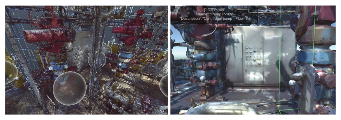
Figure 3: Point cloud model obtained from laser scanning survey in Recap Pro (left); Displaying 3D model and associated Tag data from an asset in Unity (right).