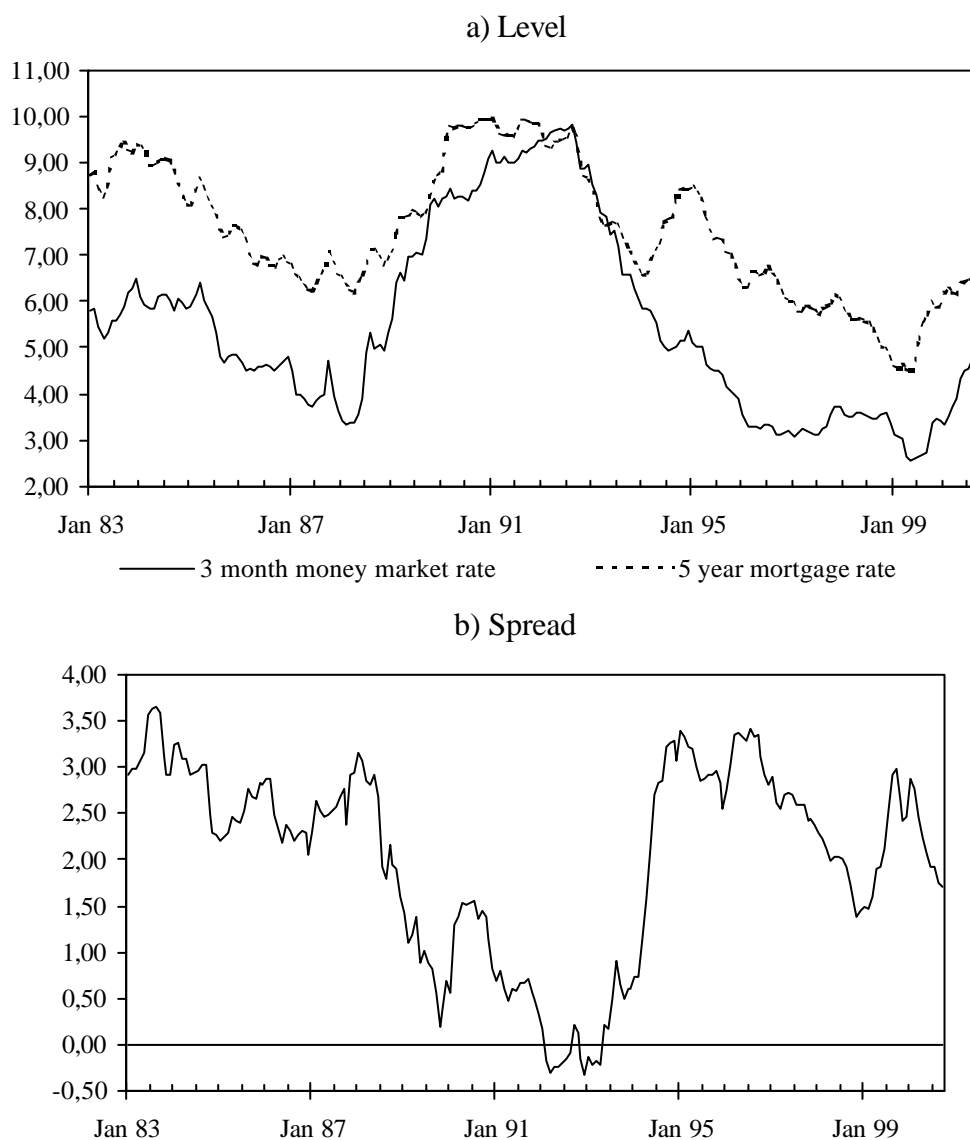
Figure 3 5 year mortgage rate and 3 month money market rate since 1983

Based on the information of the time the Bauspar-Loan is taken, the fraction (in percent) of the initial savings and loan contract, consisting of accumulated savings of the Bausparerer is calculated, Anspar . Additional information about the borrower is limited to the age when he closed the savings and loan contract and the age when he obtained the loan, Age1 and Age2 respectively.